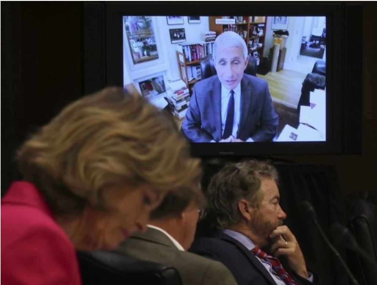
Fauci speaking via teleconference to the committee today

Fauci said at the committee hearing today that he's concerned about cities and states reopening without reaching "checkpoints" outlined by the administration in guidelines to help them decide when it's safe. "I feel if that occurs, there is a real risk that you will trigger an outbreak that you might not be able to control," Fauci said. "In fact, paradoxically, it will set you back—not only leading to some suffering and death that could be avoided but it could even set you back on the road on trying to get economic recovery."