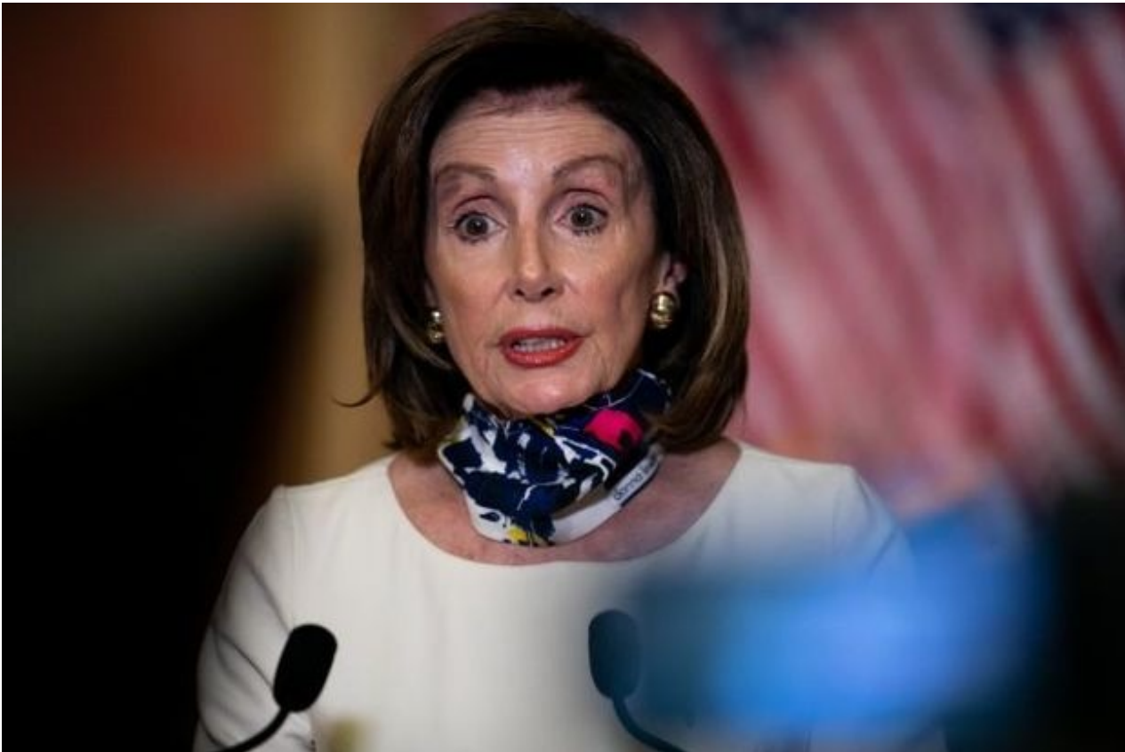
Pelosi speaking on the stimulus measure today.

House Democrats proposed a $3 trillion coronavirus relief bill (H.R. 6800) today, combining new relief to state and local governments with direct cash payments, expanded unemployment insurance and food stamp funds, as well as a list of progressive priorities like funds for voting by mail and the troubled U.S. Postal Service.