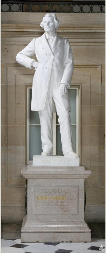
John Gorrie, M.D. (1803-1855)

Distinction: Considered the “Father of Air Conditioning”