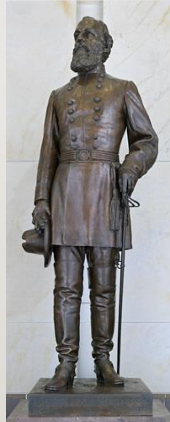
General Kirby Smith (1824-1893)

Connection to Florida: Lived and worked for a lifetime in Florida and invented the first “ice machine” for cooling patients (the forerunner of modern air conditioning)